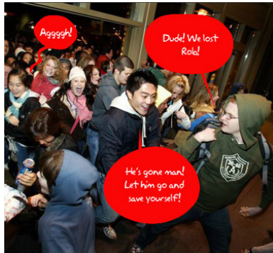
25 people died in this store alone. That's not counting the 32 missing, and 67 injured, as well as the mentally scarred...

a flat panel display... well it should be the last one standing. But in order for this to happen some simple rules need to be put in place. First, no weapons. Weapons are cool and all but no one these days is trained in weaponry. Guns would be nice, but then the fight would be too short lived. Second, well I ran out of rules so the second rule is there are no rules (except for weapons, those aren't allowed). I can't wait for the day when I can sit at home on Black Friday, turn on the TV and watch wacked out people fight for material items the way they were meant to, in the ring. 🐮