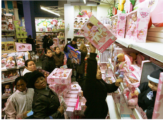
ZE BARBIES. MUST GET ZE BARBIES!

caning people, soccer moms taking Not only that, but I also think that the more valuable the item, the more you should have to fight for it. For a Tickle Me Elmo, the loser will be the first con-