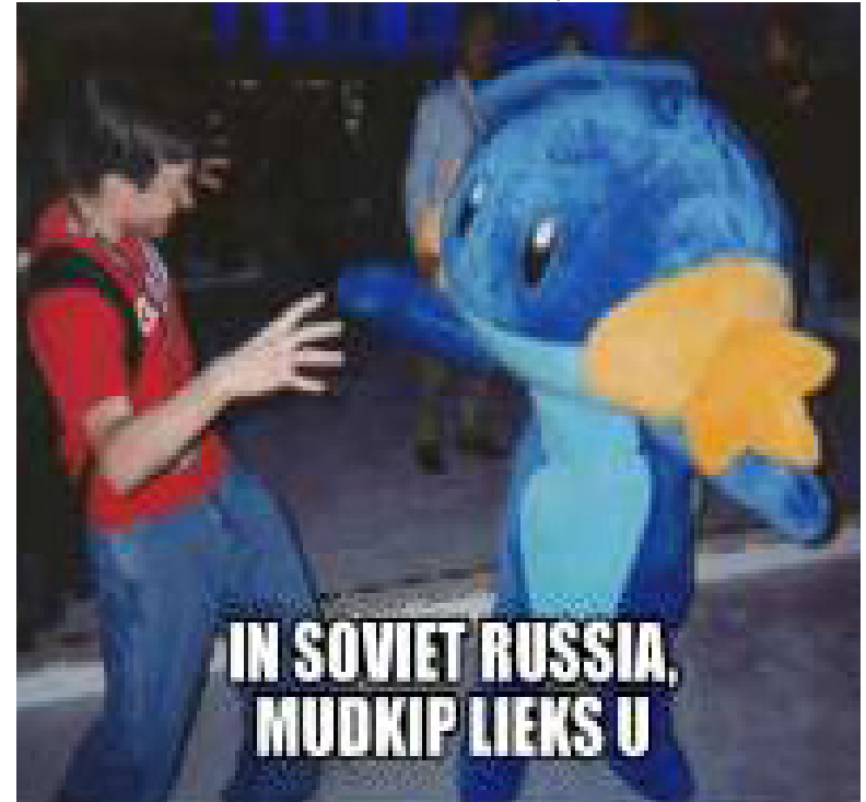
Oh God, the .jpeg artifacts.